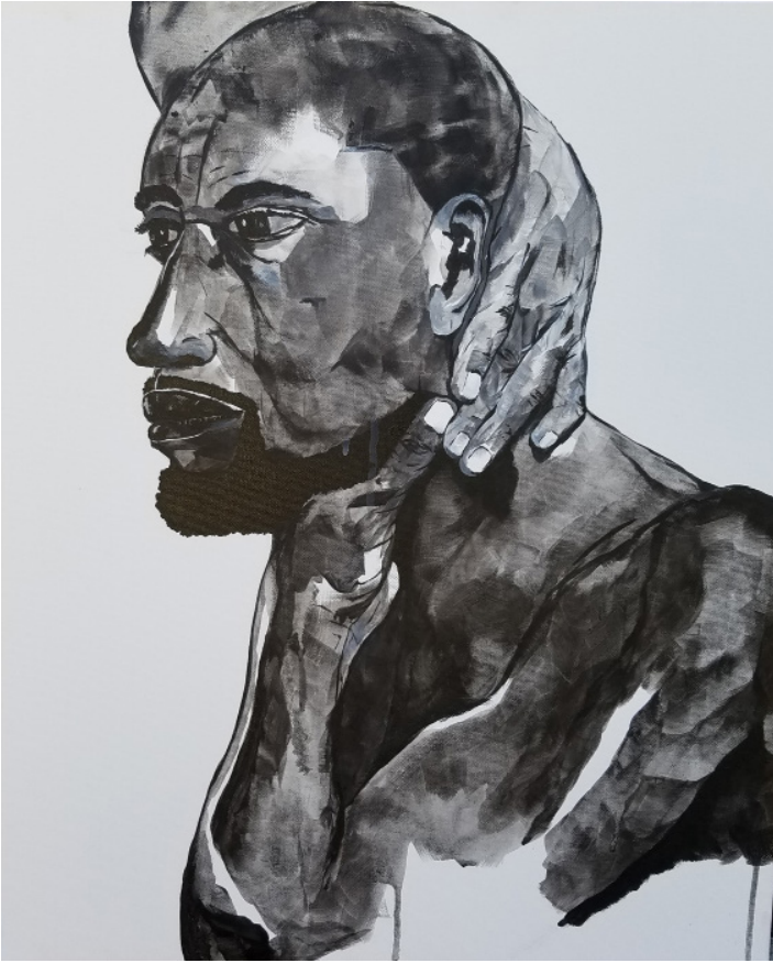
As I Ponder, Acrylic on Canvas, 20" x 24"